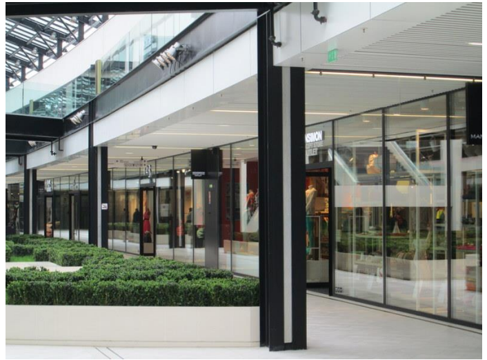
One Nation Paris, Les Clayes sous Bois (F) Catinvest