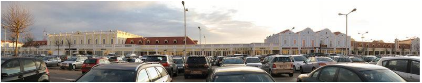
Designer Outlet Parndorf, Parndorf (A) McArthurGlen