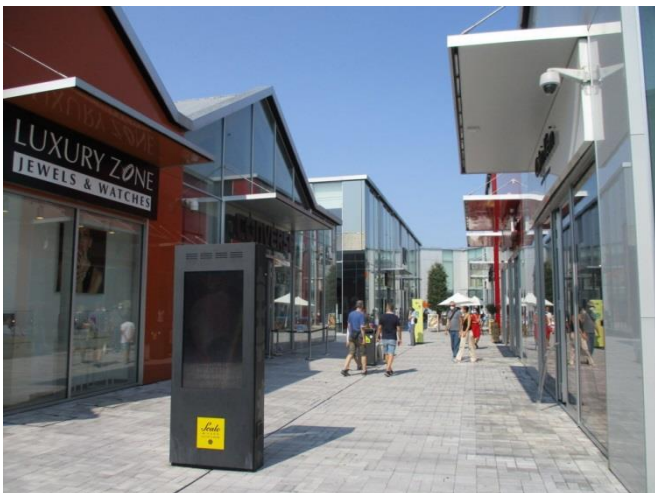
Scalo Milano Outlet & more, Locate di Triulzi (I) Locate District Spa