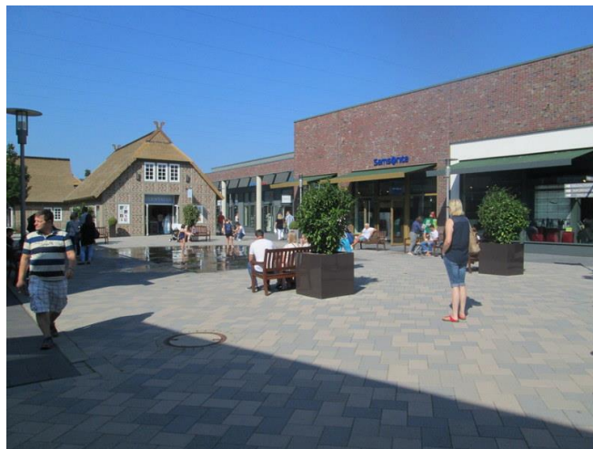
Designer Outlet Soltau, Soltau (D) ROS Retail Outlet Shopping