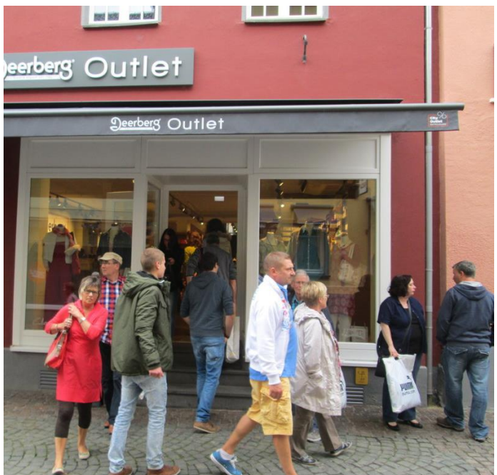
City Outlet Bad Münstereifel, Bad Münstereifel (D) City Outlet Bad Münstereifel GmbH (this picture was taken before the destruction by the flood disaster of Juli 2021)