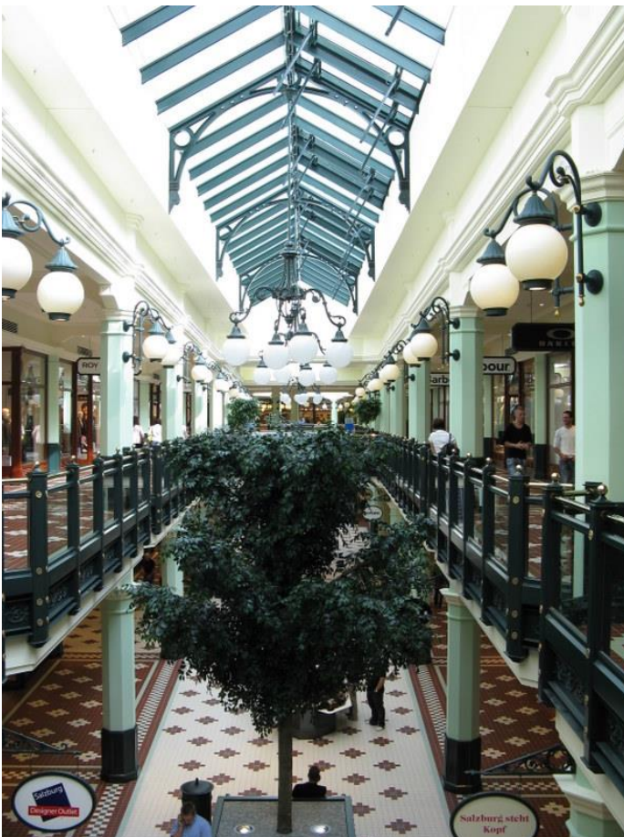
Designer Outlet Salzburg, Wals-Siezenheim (A) McArthurGlen