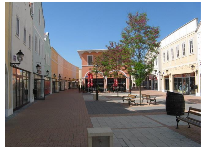
Roses Designer Outlet, Sveti Kriz Zacrctje (HR) Roses Values