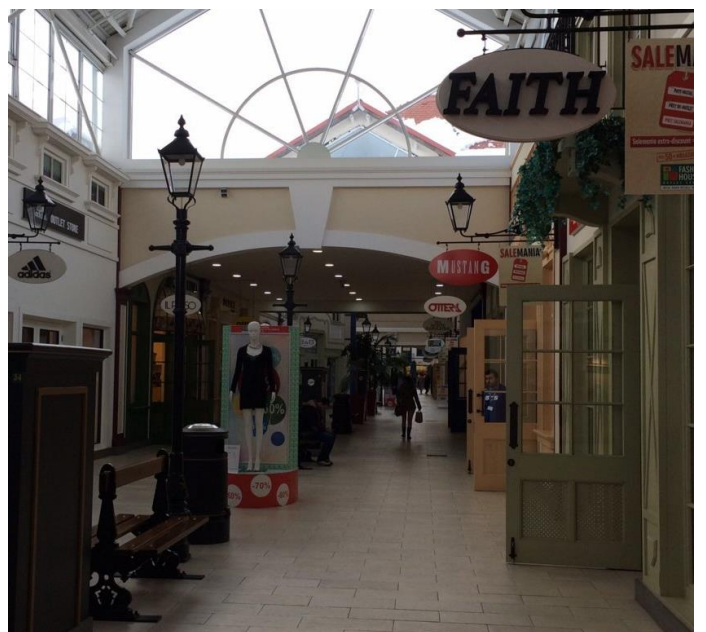
Fashion House Outlet Centre Bucharest, Bucharest (RO) Fashion House Outlet Management