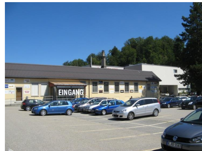
Outletpark Switzerland, Murgenthal (CH) Interdomus AG