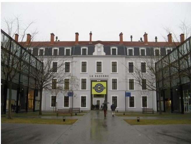
Marques Avenue Romans, Romans sur Isère (F) Marques Avenue Group