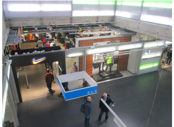
Seemaxx Outlet Center, Radolfzell (D) Kintyre Investments