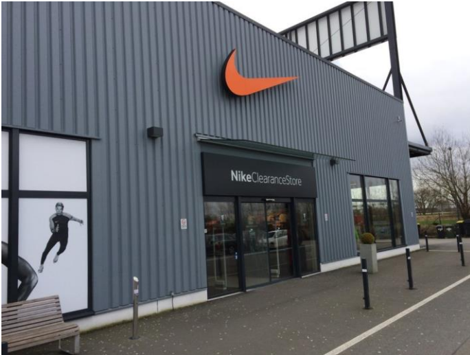
Hanse Outlets, Broderstorf (D) Outlet Evolution Services