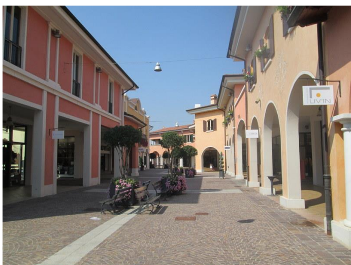
Mantova Outlet Village, Bagnolo San Vito (I) Multi Outlet Management Italy