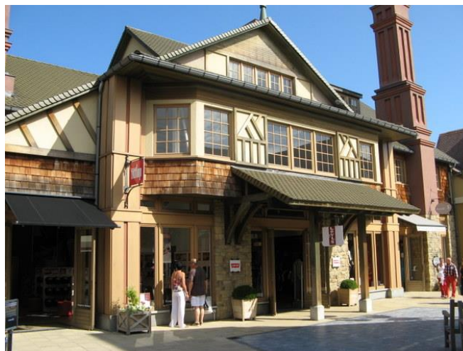
Maasmechelen Village, Maasmechelen (B) Value Retail