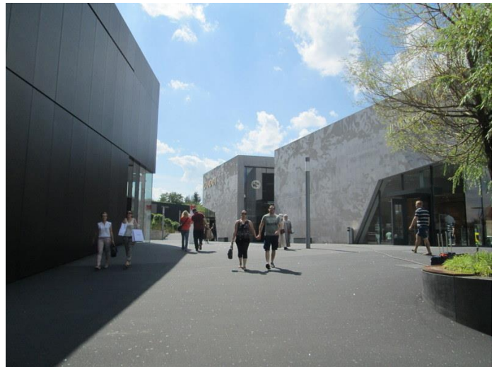
Outletcity Metzingen, Metzingen (D) Outletcity AG