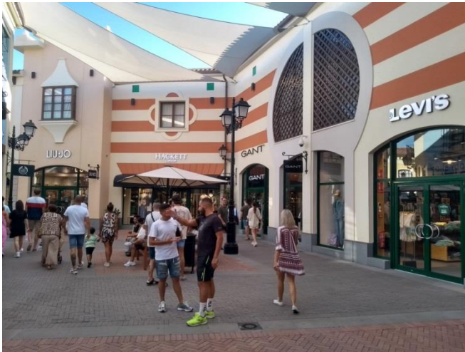
Designer Outlet Malaga, Malaga (E) McArthurGlen