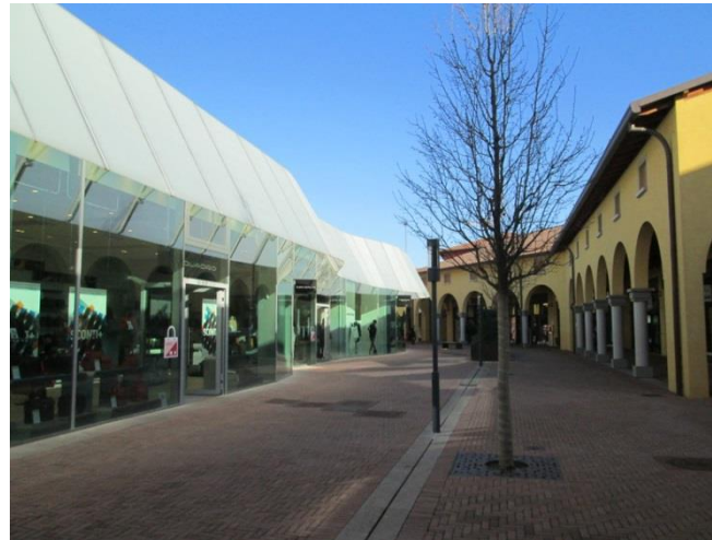
Castel Guelfo di Bologna The Style Outlets, Castel Guelfo (I) Neinver