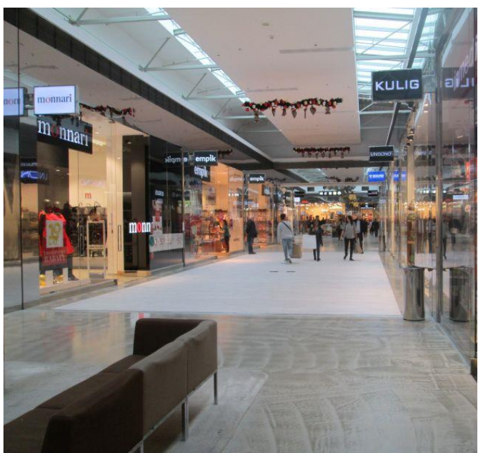
Factory Kraków, Modlniczka (PL) Neinver