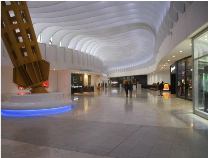
ICON Outlet at the O2, London (UK) CBRE Management