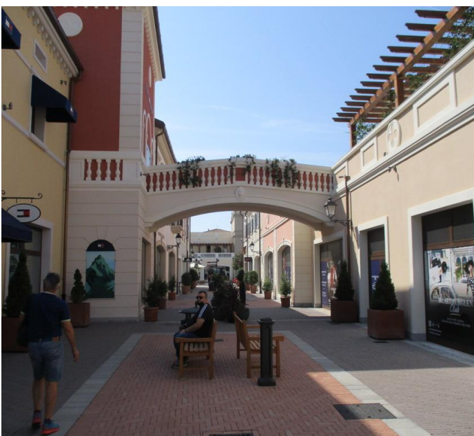
Designer Outlet Noventa, Noventa di Piave (I) McArthurGlen