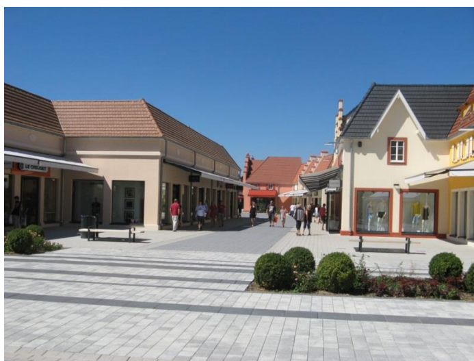
Roppenheim The Style Outlets, Roppenheim (F) Neinver