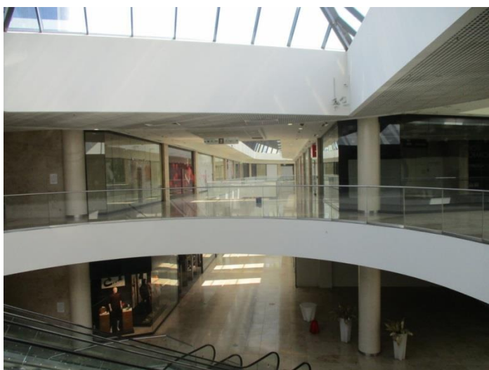
Sofia Outlet Center, Sofia (BG) Operator unknown