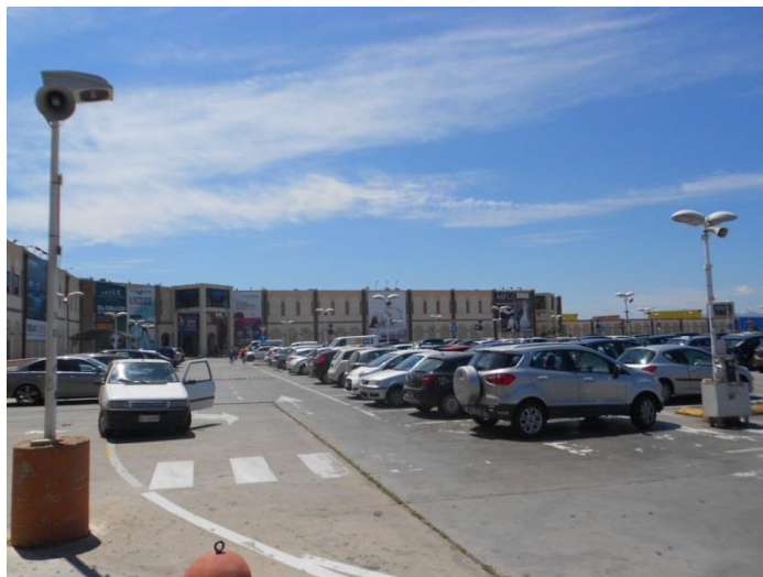
Sardinia Outlet, Sestu (I) Cogest Retail Ltd