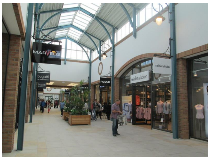
Halle-Leipzig The Style Outlets, Brehna (D) Neinver