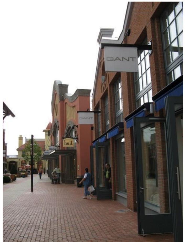
Ingolstadt Village, Ingolstadt (D) Value Retail