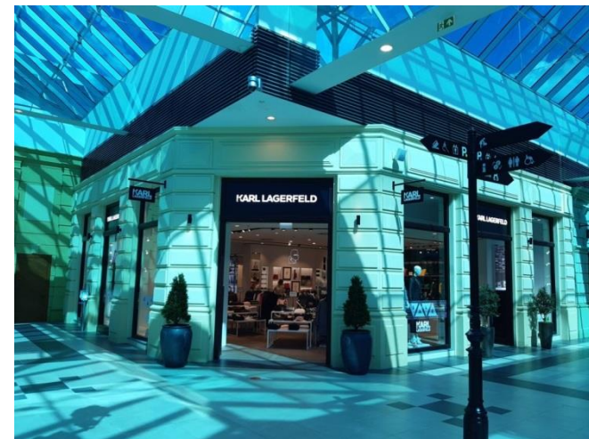
Premium Outlet Prague Airport, Ruzyně (CZ) The Prague Outlet One a.s.