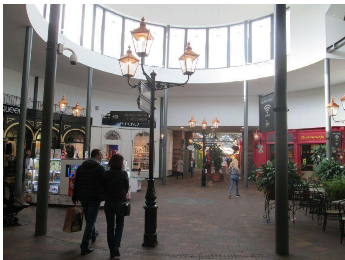
Designer Outlet Sosnowiec, Sosnowiec (PL) ROS Retail Outlet Shopping