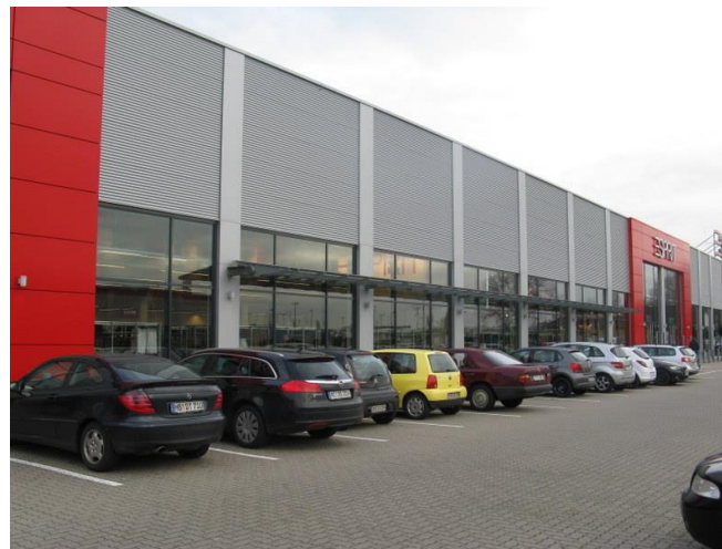
Ochtum Park, Stuhr-Brinkum (D) MiRo Grundstücksverwaltung GmbH