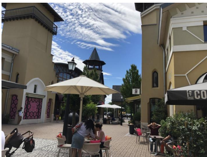
Wertheim Village, Wertheim (D) Value Retail