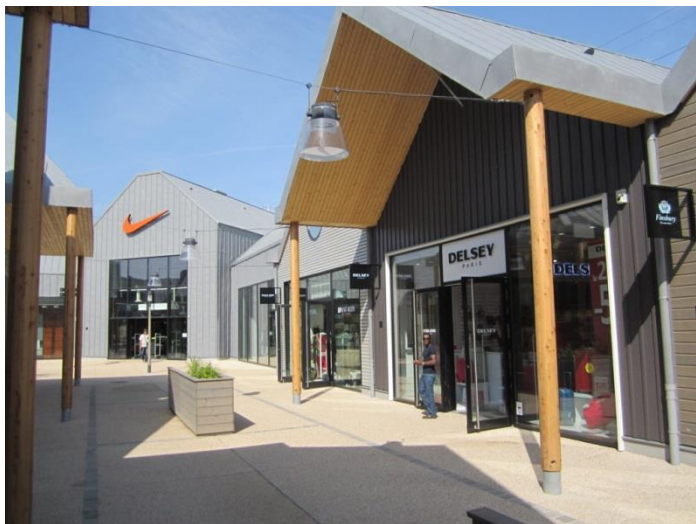
Marques Avenue A13, Aubergenville (F) Marques Avenue Group