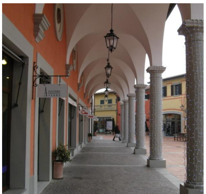
Designer Outlet Barberino, Barberino di Mugello (I) Promos