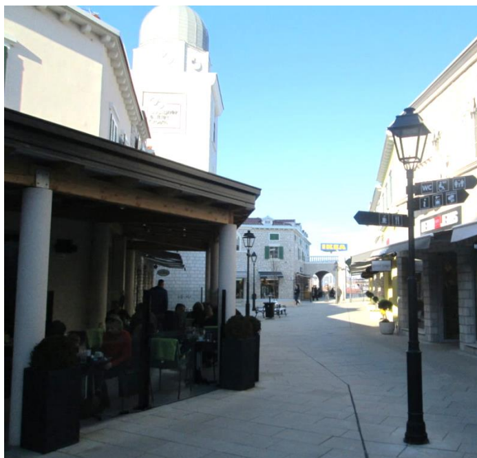
Designer Outlet Croatia, Rugvica (HR) ROS Retail Outlet Shopping