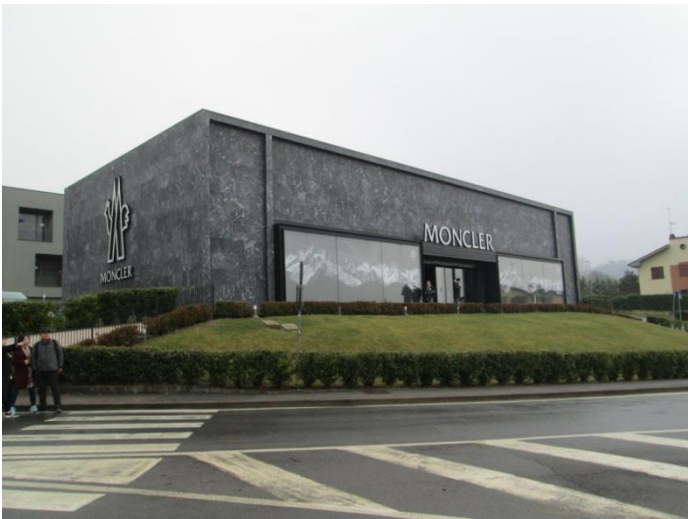
The Mall, Leccio Reggello (I) Design Management Srl