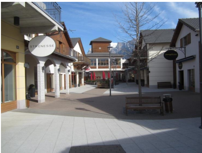
Fashion Outlet Landquart, Landquart (CH) VIA Outlets