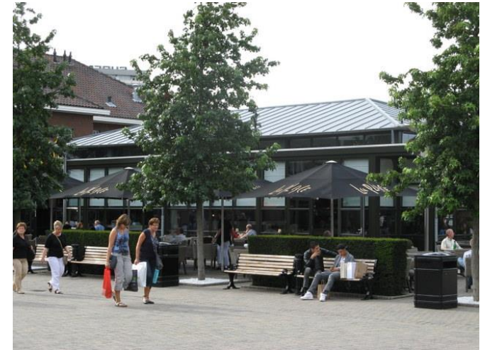
Roermond Designer Outlet, Roermond (NL) McArthurGlen