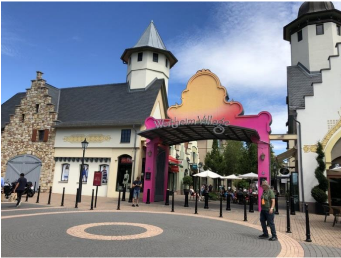
Wertheim Village, Wertheim (D) Value Retail