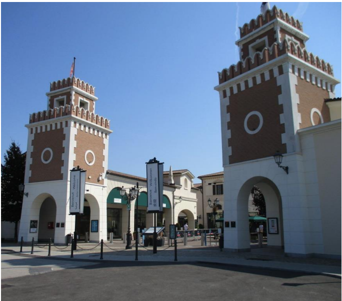
Designer Outlet Noventa, Noventa di Piave (I) McArthurGlen