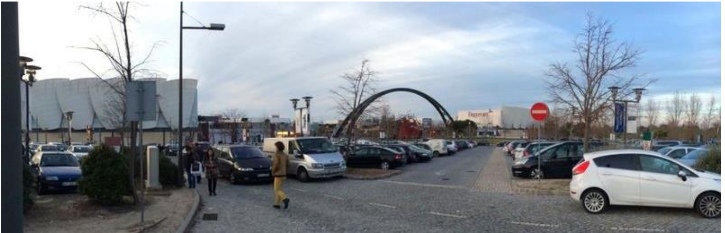
Freeport Lisboa Fashion Outlet, Alcochete (PT) VIA Outlets