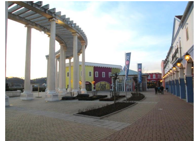
Roses Designer Outlet, Sveti Kriz Zacretje (HR) Roses Values