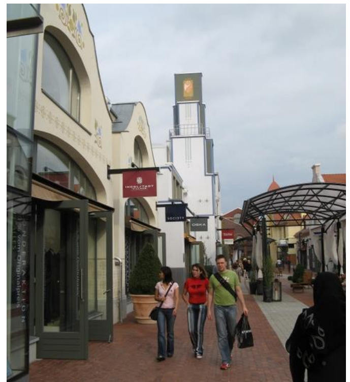
Ingolstadt Village, Ingolstadt (D) Value Retail