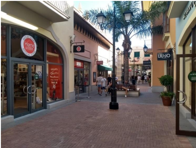
Designer Outlet Malaga, Malaga (E) McArthurGlen