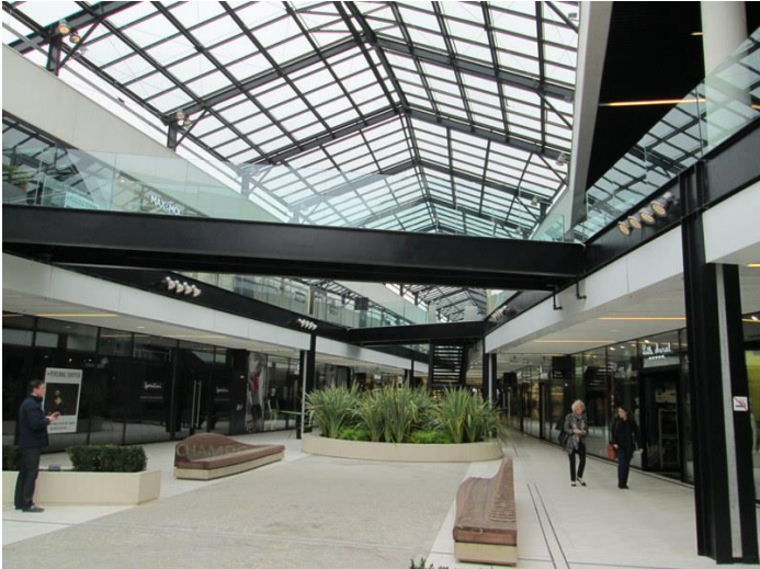
One Nation Paris, Les Clayes sous Bois (F) Catinvest