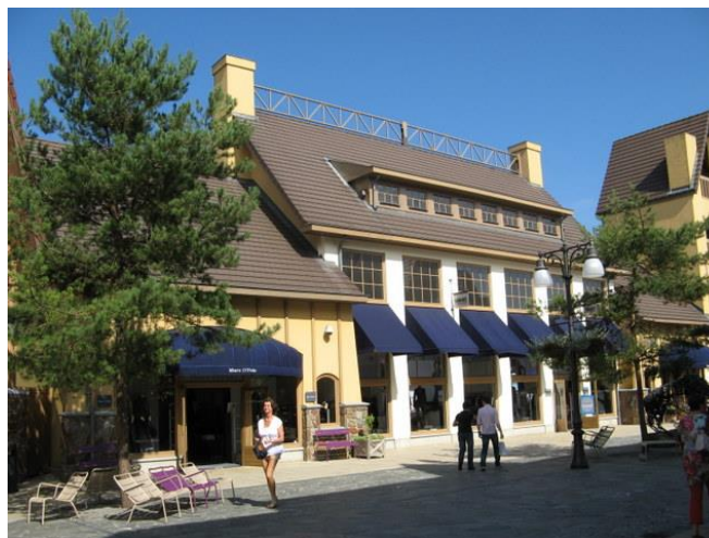
Maasmechelen Village, Maasmechelen (B) Value Retail