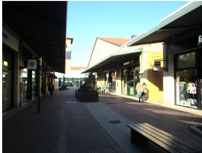
Castel Guelfo di Bologna The Style Outlets, Castel Guelfo (I) Neinver