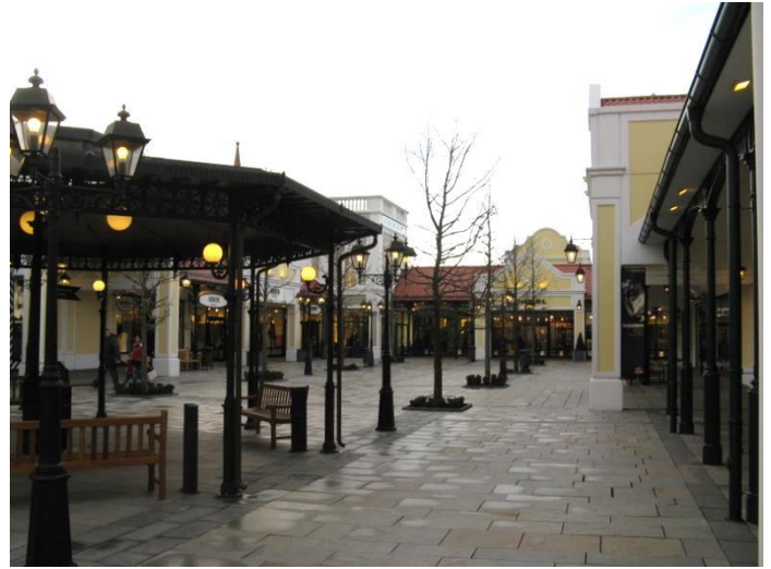
Designer Outlet Parndorf, Parndorf (A) McArthurGlen