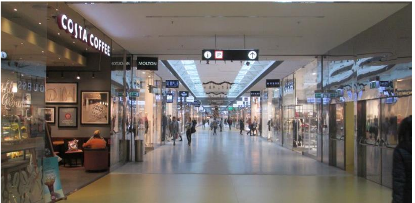
Factory Kraków, Modlniczka (PL), Neinver