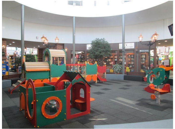
Designer Outlet Sosnowiec, Sosnowiec (PL) ROS Retail Outlet Shopping