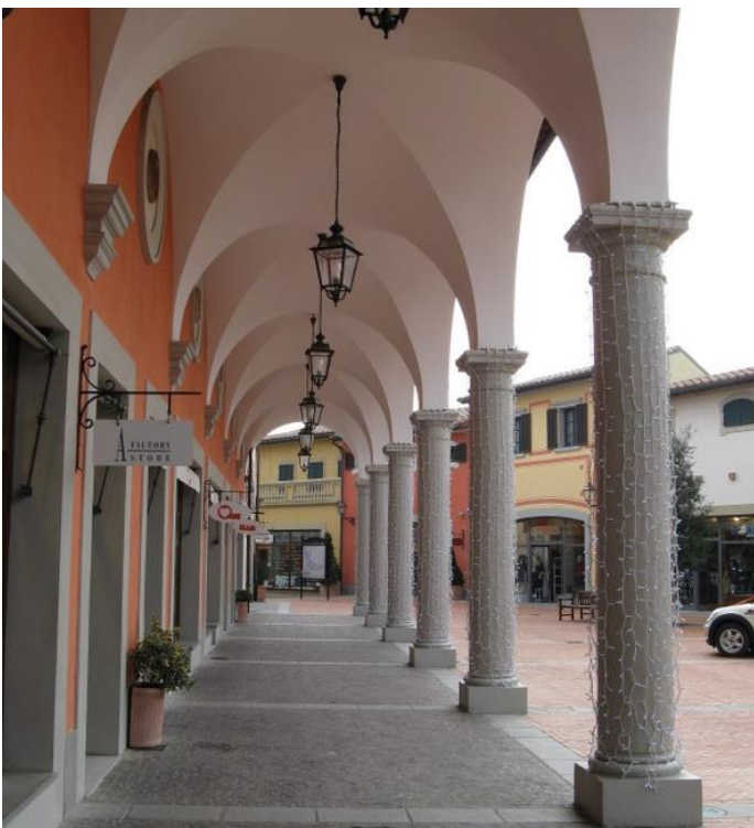
Designer Outlet Barberino, Barberino di Mugello (I) McArthurGlen