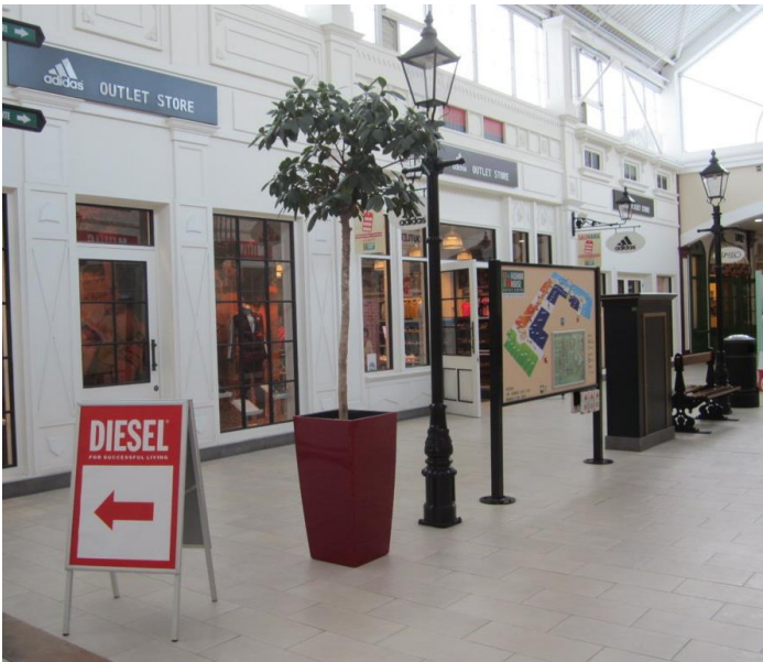
Fashion House Outlet Centre Bucharest, Bucharest (RO) Fashion House Outlet Management