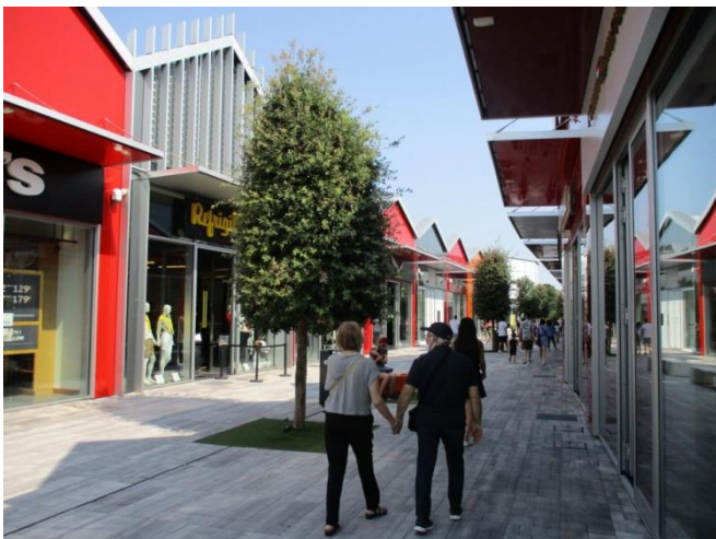
Scalco Milano Outlet & more, Locate di Triulzi (I) Locate District Spa