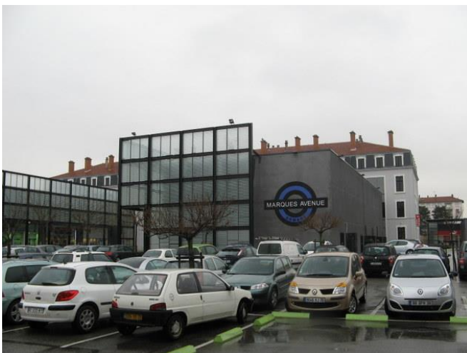
Marques Avenue Romans, Romans sur Isère (F) Marques Avenue Group