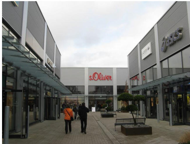
Ochtum Park, Stuhr-Brinkum (D) MiRo Grundstücksverwaltung GmbH