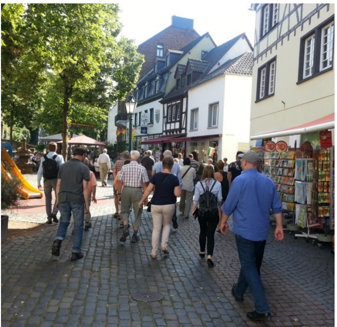
City Outlet Bad Münstereifel, Bad Münstereifel (D) City Outlet Bad Münstereifel GmbH (this picture was taken before the destruction by the flood disaster of July 2021)