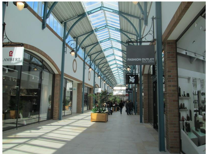
Halle-Leipzig The Style Outlets, Brehna (D) Neinver