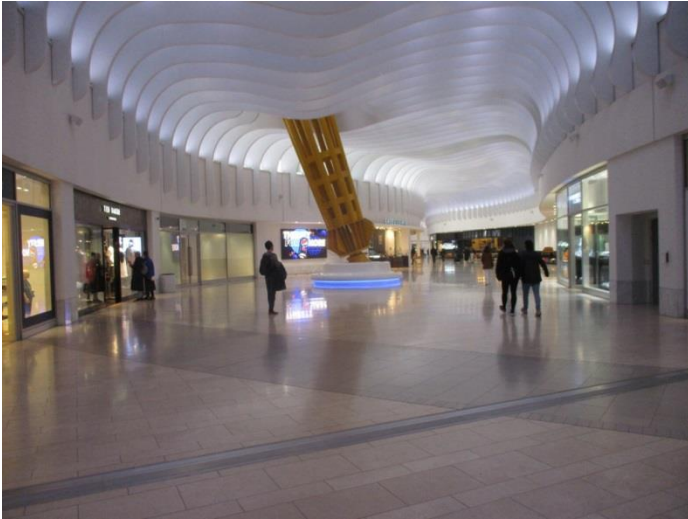
ICON Outlet at the O2, London (UK)