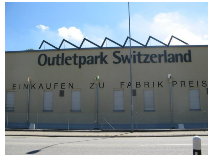
Outletpark Switzerland, Murgenthal (CH) Interdomus AG