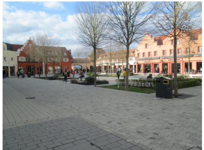
Roppenheim The Style Outlets, Roppenheim (F) Neinver