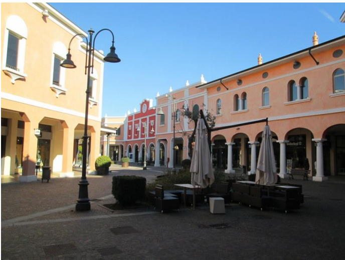
Mantova Outlet Village, Bagnolo San Vito (I) Multi Outlet Management Italy