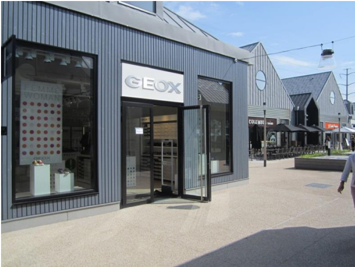
Marques Avenue A13, Aubergenville (F) Marques Avenue Group