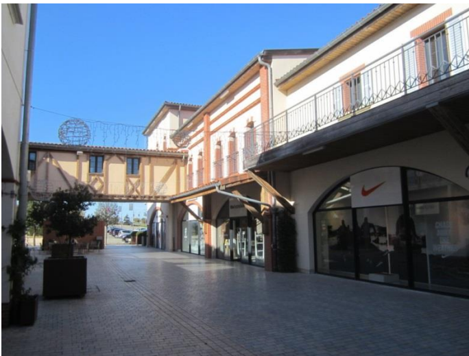
Nailloux Outlet Village, Nailloux (F) Advantail