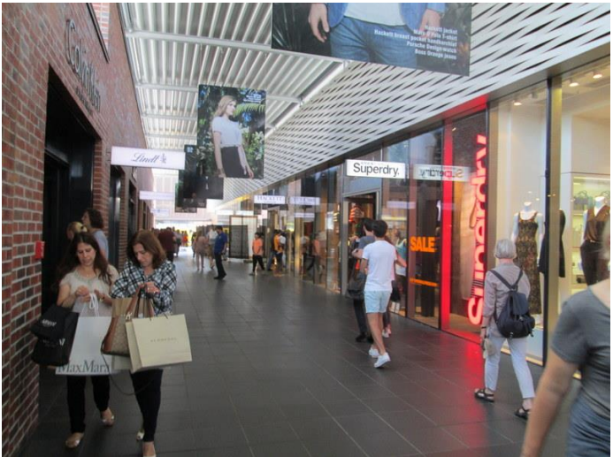
Outlecity Metzingen, Metzingen (D)