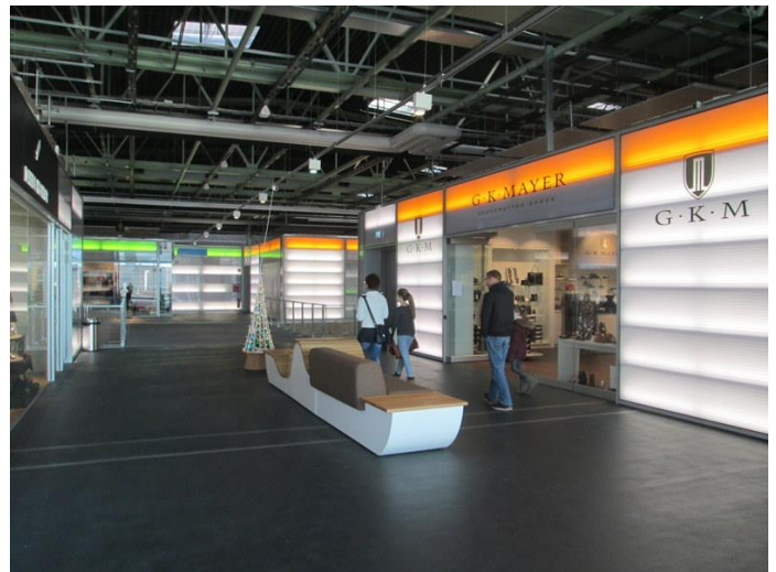
Seemaxx Outlet Center, Radolfzell (D) Kintyre Investments