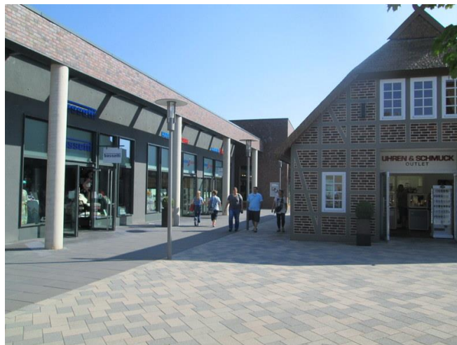
Designer Outlet Soltau, Soltau (D) ROS Retail Outlet Shopping