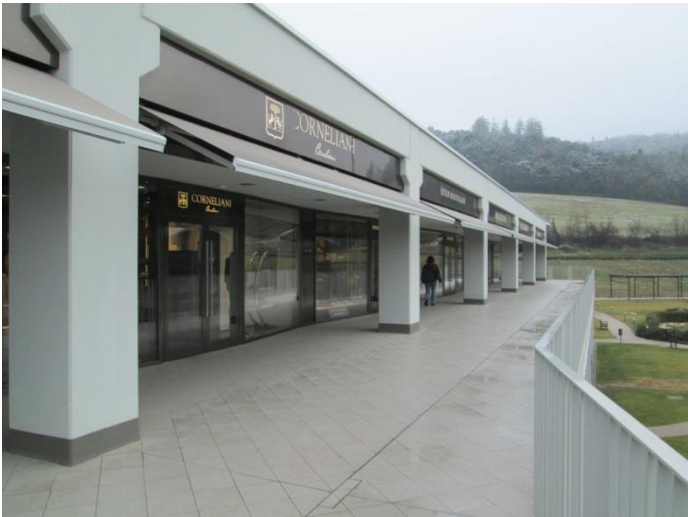
The Mall, Leccio Reggello (I) Design Management Srl