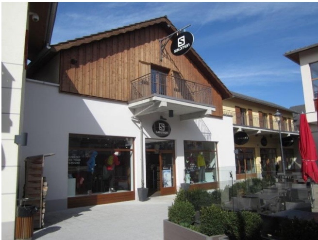
Fashion Outlet Landquart, Landquart (CH) VIA Outlets