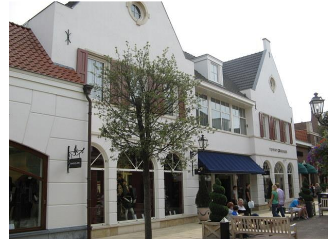
Roermond Designer Outlet, Roermond (NL) McArthurGlen