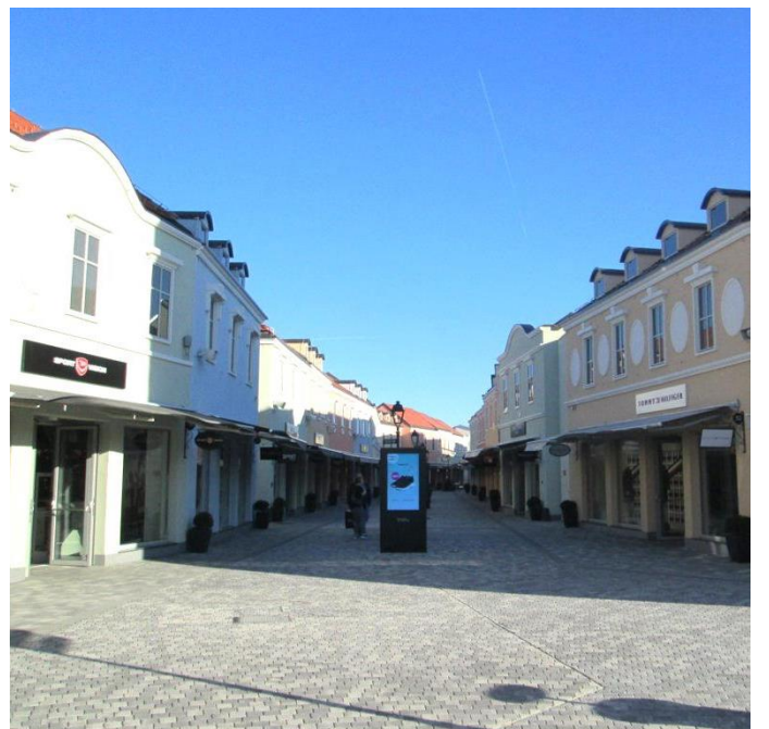
Designer Outlet Croatia, Rugvica (HR) ROS Retail Outlet Shopping